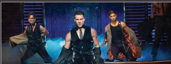
Magic Mike is loosely based on Channing’s real-life experiences

So whether you’re looking for action-packed, adrenaline-pumped fight scenes, or a fun comedy with good looking guys taking their shirts off, Channing Tatum’s got you covered.