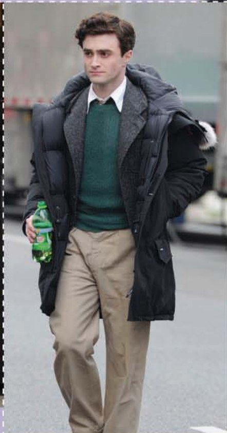
Daniel Radcliffe enjoys a Canada Dry beverage in between takes on the set of Kill Your Darlings in New York City.