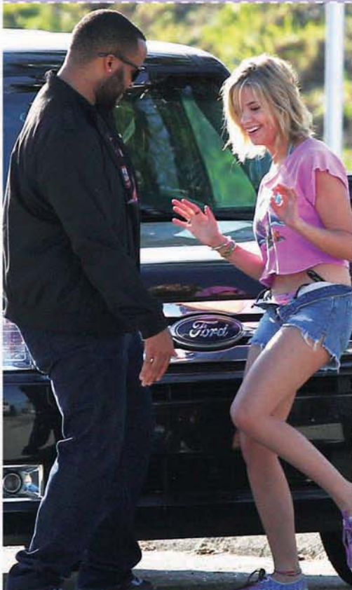
Ashley Benson has fun on the set of Spring Breakers , which also stars Selena Gomez and Vanessa Hudgens.