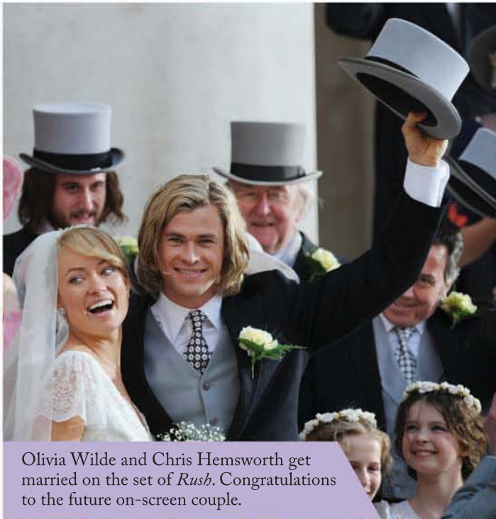
Olivia Wilde and Chris Hemsworth get married on the set of Rush . Congratulations to the future on-screen couple.