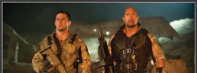
Channing and Dwayne Johnson in G.I. Joe: Retaliation